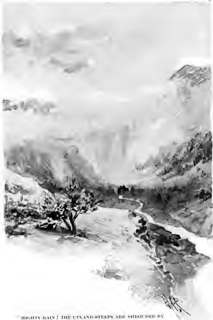
“MIGHTY RAIN! THE UPLAND STEEP'S ARE SHROUDED BY THEY MISTS.”—Page 227.